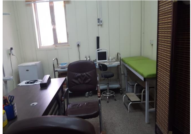
Clinical Health Room (Imam Ja'afar Al-Sadiq University, Iraq).