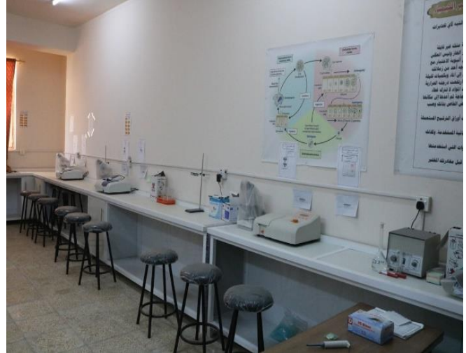
Examples of health infrastructure facilities for students and academic and administrative staff wellbeing (Imam Ja'afar Al-Sadiq University, Iraq).