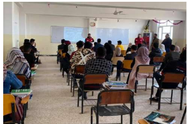
An introductory symposium on the disease (the new corona) at the university in cooperation with the Red Crescent Society in the Muthanna branch.