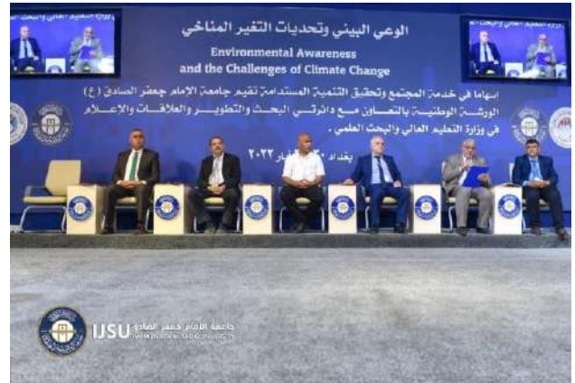
Workshop on Environmental Awareness and the Challenges of Climate Change held at Imam Ja'afar Al-Sadiq University.