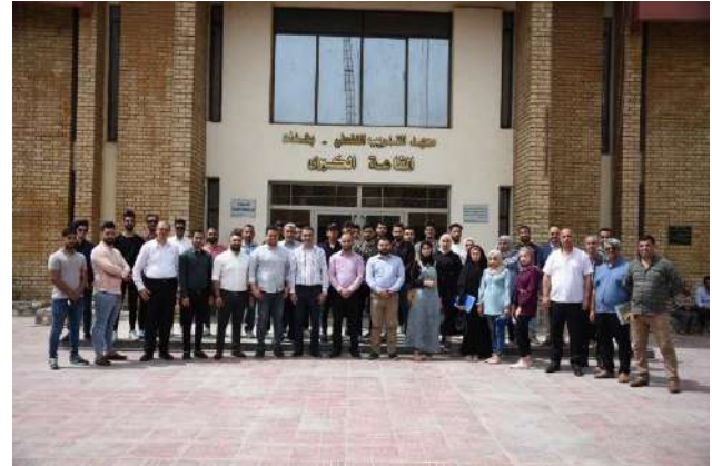
The College of Information Technology has organized several scientific visits to introduce its students to the latest technologies used in government departments such as the Oil Training Institute in Baghdad province.