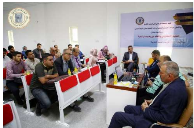
The Research and Development Department of the Ministry of Higher Education and Scientific Research holds a workshop entitled "E-learning and distance learning" at Imam Ja'afar Al-Sadiq University, Muthanna Branch.