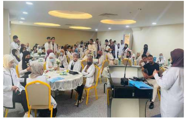
The Department of Medical Laboratory Technologies at Imam Ja'afar Al-Sadiq University, Najaf Branch, organized a scientific visit to Amal Al-Hayat Hospital for Oncology and Hematology in Najaf Province.

Examples of Events Related to Sustainability (Imam Ja'afar Al-Sadiq University, Iraq).