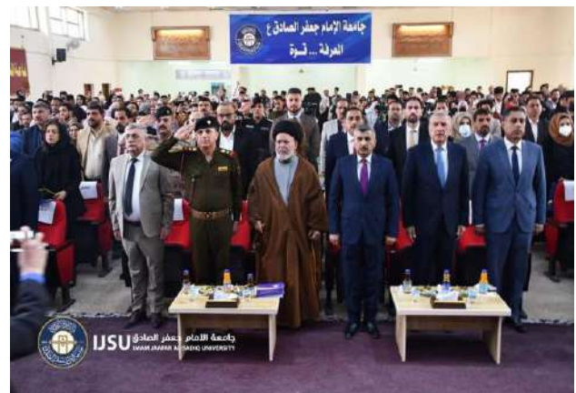
Safety and Security Coordination Festival. It is an annual regular event organized by Imam Ja'afar Al-Sadiq University.