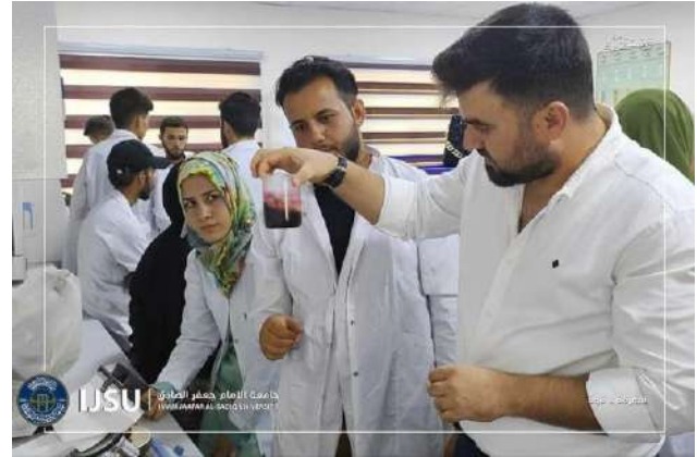
Examples of some summer training lectures for students of the Department of Medical Laboratory Technology.