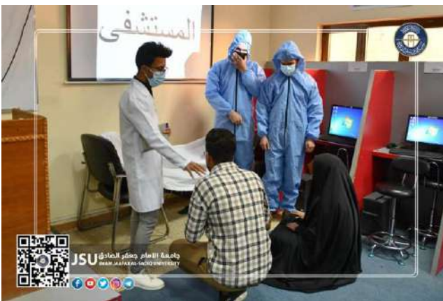
The College of Administrative Sciences and Financial organizes a representative play to introduce the dangers of Corona disease and how to take the necessary measures in the case of an infection.