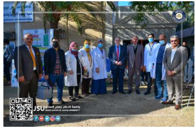
A campaign to raise awareness and motivate students to take vaccinations against the Corona virus.