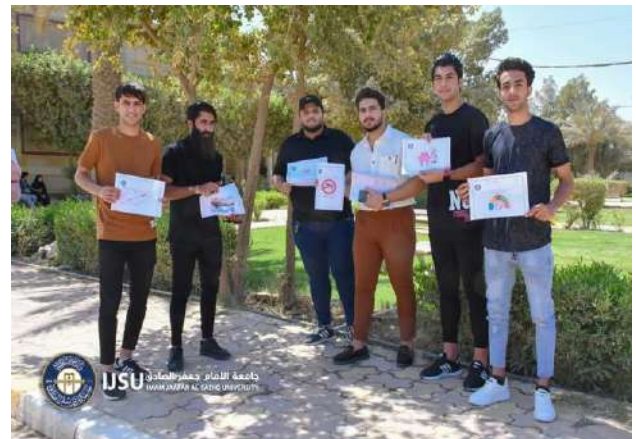
Organizing a campaign to raise awareness about the dangers of smoking.