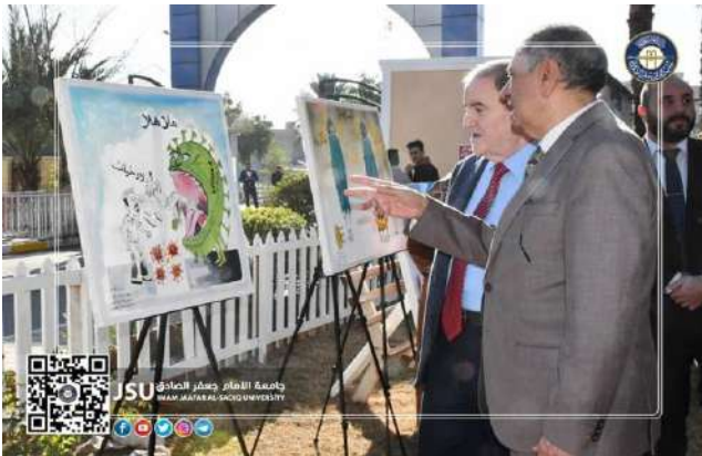
Photo gallery to introduce corona disease and its risks using pictures.

An overall average per annum over the last 3 years of 78 events (e.g. conferences, workshops, awareness raising, practical training, etc.).