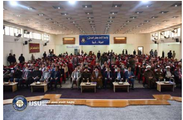
Imam Jaafar Al-Sadiq University holds a workshop on ways to combat drugs.