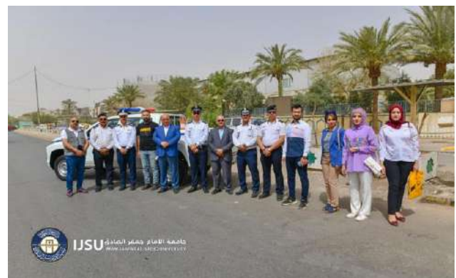
The Department of Media at the College of Literature- Baghdad Branch organizes a traffic awareness campaign.