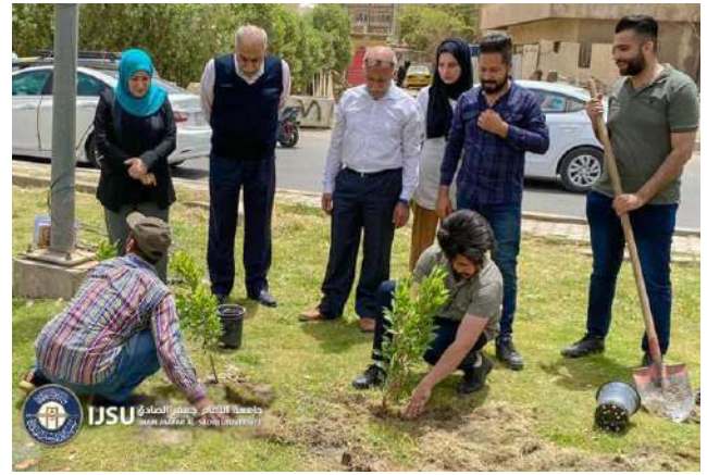
Organizing a number of afforestation campaigns to maintain the university's campus gardens.