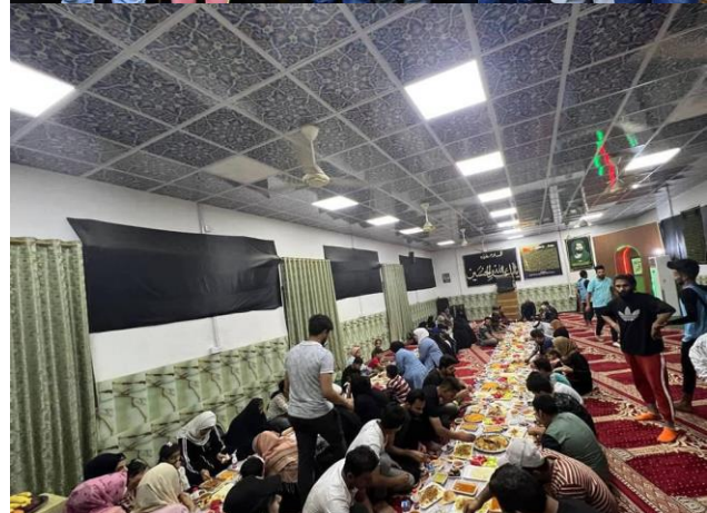
Examples of conducted social solidarity programs on campus (Imam Ja'afar Al-Sadiq University, Iraq).