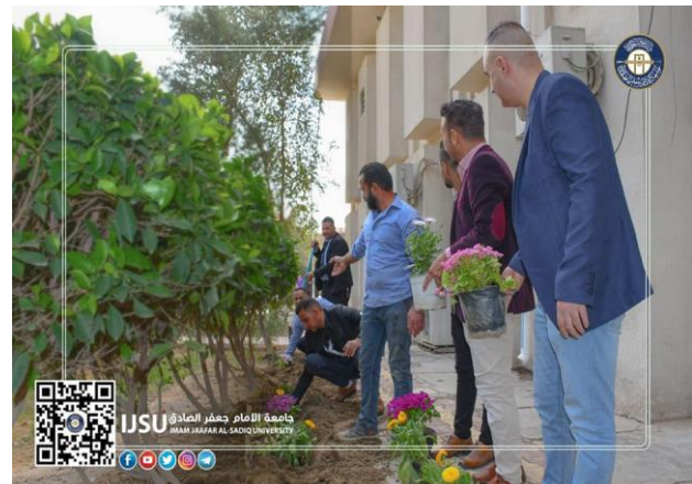
Examples of volunteer works implemented within the Imam Ja'afar Al-Sadiq University.

Imam Ja'afar Al-Sadiq University is dedicated to giving its students a great education, opportunities for life - long learning, and distinctive campus experiences since it works to improve the future while preserving history and culture. It is committed to producing talented leaders who give back to their