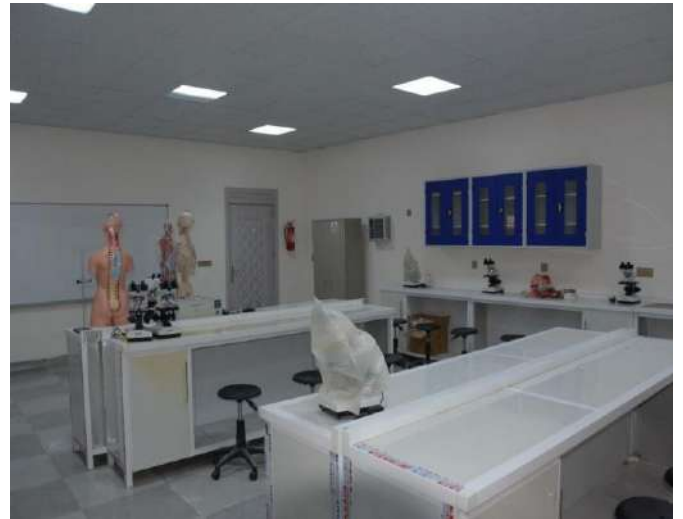
Some examples of teaching halls, scientific laboratories, and E-learning methods (Imam Ja'afar Al-Sadiq University, Iraq).